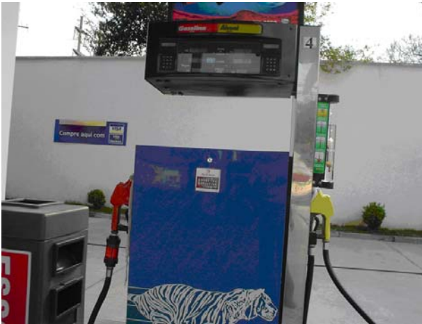
Fig. 2 Photo of service station fuel nozzles for gasoline and alcohol, showing a densimeter, above the alcohol nozzle at right side, to guarantee the alcohol purity.

ethanol engines and the power of the gasoline engine; the curve 2 represents the ratio between the mass specific fuel consumption of ethanol engines and the specific fuel consumption of the gasoline engine; the curve 3 represents the ratio of volumetric specific fuel consumption of ethanol engines and the correspondent consumption of gasoline engine; the curve 4 represents the ratio of mass specific fuel consumption of both engines for same power delivered.